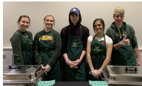
SJSH Students Placed 2nd at The Gathering Place 2019 Soup's On Competition