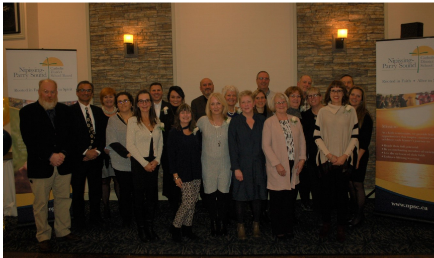
Celebrating NPSC 25 Year Employees and Recent Retirees

15 Early French Immersion Information Night (North Bay and Area Families) Wednesday, January 15, 2020 St. Luke School (225 Milani Road, North Bay) 6:00pm