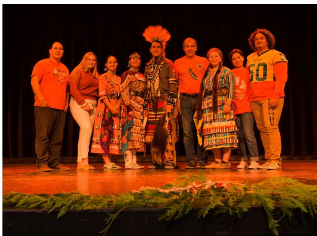
Celebrating Orange Shirt Day at SJSH

12 SJSH Bears Music Christmas Concert Thursday, December 12 St. Joseph-Scollard Hall (675 O'Brien Street, North Bay) 6:30pm