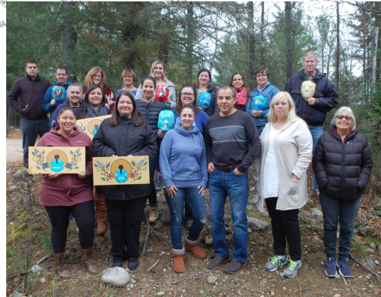
Educators from schools across NPSC took part in the Annual Indigenous Education Staff Retreat in October. Staff participated in lessons and workshops to learn about and experience indigenous culture.