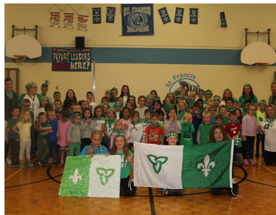
On September 25, students and staff (including St. Francis students, pictured here) joined the province to celebrate Franco-Ontarian Day. Dressing in green and white, students celebrated French language and French culture. Nous sommes vraiment fiers de nos élèves qui continuent leurs études en français et en anglais. Bravo!