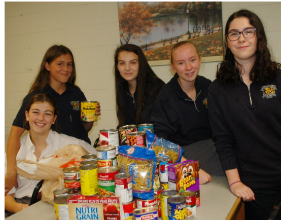
Congratulations to the staff, students, parents and alumni at SJSH who collected 2524 pounds of food for the North Bay Food Bank!